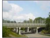
Overpass / Underpass