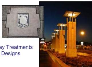
Gateway Treatments & Designs