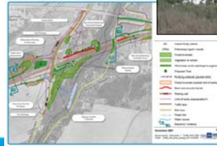
Enhanced Landscape Improvement Concepts

Fencing helps minimize wildlife access to the highway, reducing wildlife collisions