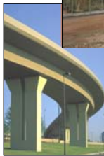
Bridge Designs / Watercourse Crossings