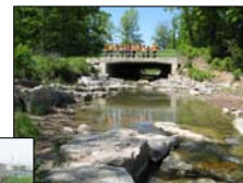
Wildlife Crossings & Structural Treatment with Pedestrian Passage / Trails