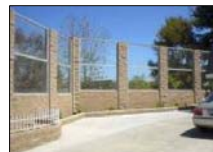
Enhanced Aesthetic Designs