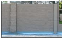
Enhanced Noise / Privacy Walls

Landscaping – berms constructed with excess earth material can enhance aesthetics and mitigate noise